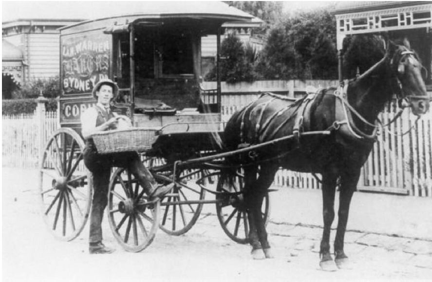
'Days gone by'